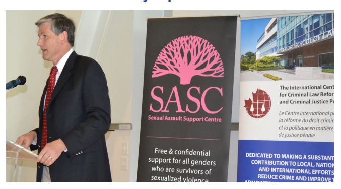
(Pictured) Hon. Andrew Wilkinson- BC Minister of Advanced Education

On May 30, 2016, the International Centre for Criminal Law Reform and Criminal Justice Policy (ICCLR), the UBC Alma Mater Society's Sexual Assault Support Centre (SASC), and Ending Violence Association of British Columbia (EVA BC) organized and hosted a one-day, pre-conference symposium centred on the development and implementation of post-secondary policies, protocols and prevention strategies with regards to sexual violence and misconduct on post-secondary campuses. The event was developed as part of the Department of Justice Canada's Victims and Survivors of Crime Awareness Week 2016 initiative.