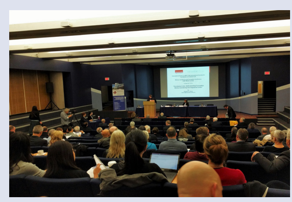
Follow the Money Conference held at UBC Robson Square on October 28th, 2016