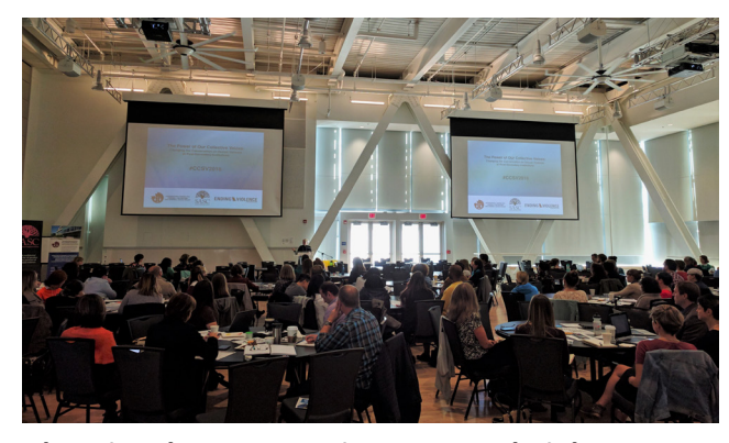
Changing the Conversation on Sexual Violence Conference held at UBC, Vancouver on September 30th - October 1st

On September 30 - October 1, 2016 the ICCLR again partnered with UBC SASC and EVA BC to organize and host a two-day conference on sexual violence on post-secondary institutions. In the two-day event, we provided tools to better respond to campus sexual violence, and inform and discuss the development and implementation of post-secondary policies, protocols, prevention strategies, and community collaboration, while providing a safe space to understand and incorporate the lived experience of survivors. The conference engaged over 250 students, staff, faculty, senior administrators, government and community organizations in dialogue about sexual violence within Canadian university and college communities. Participants reported finding the information disseminated at this event and the prior symposium to overall be very useful especially as they continued to draft sexual violence and misconduct policies for their campus communities in compliance with the aforementioned Bill 23. The policies took effect on May 18, 2017 as mandated by the bill.