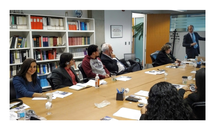
(Pictured) Anti-Corruption Seminar held at ICCLR office

On Tuesday, April 26, 2016, ICCLR organized and hosted an Anti-Corruption seminar for Senior Prosecutors and Investigators from Guatemala. The seminar was part of a broader Canadian study tour by the country's Senior Prosecutors and Investigators which was coordinated by the Justice Education Society (JES). The overall objective of the study tour was to provide the delegation with an opportunity to learn about Canadian best practices in combating corruption and to discuss future collaborative work opportunities to combat corruption in Guatemala.