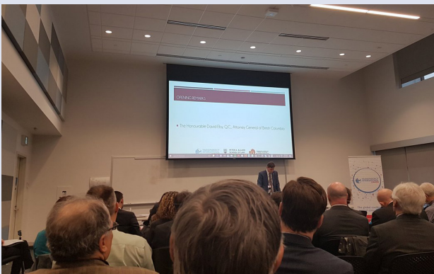
Making Progress Against Corruption Colloquium held on December 1st, 2017

In December 2017, the Centre collaborated with Transparency International Canada to host a joint colloquium titled “Making Progress Against Corruption”. The event represented a conclusion of more than one year of substantive and capacity-building events in British Columbia, geared towards the emergence of an active, multi-sectoral anti-corruption community in the region with strong national and international linkages. Our goal for the event was to identify key gaps and priorities, generate and support effective action against corruption, and enhance knowledge and awareness of these issues; and in doing so, strengthen and expand a regional network of supporters and experts committed to the fight against corruption. The colloquium was attended by over 80 participants from a diverse range of sectors including law, government and academia. Opening remarks were also provided by The Honourable David Eby, Q.C., the current Attorney General of British Columbia.