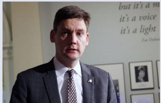
The Honourable David Eby giving remarks during the anti-corruption colloquium